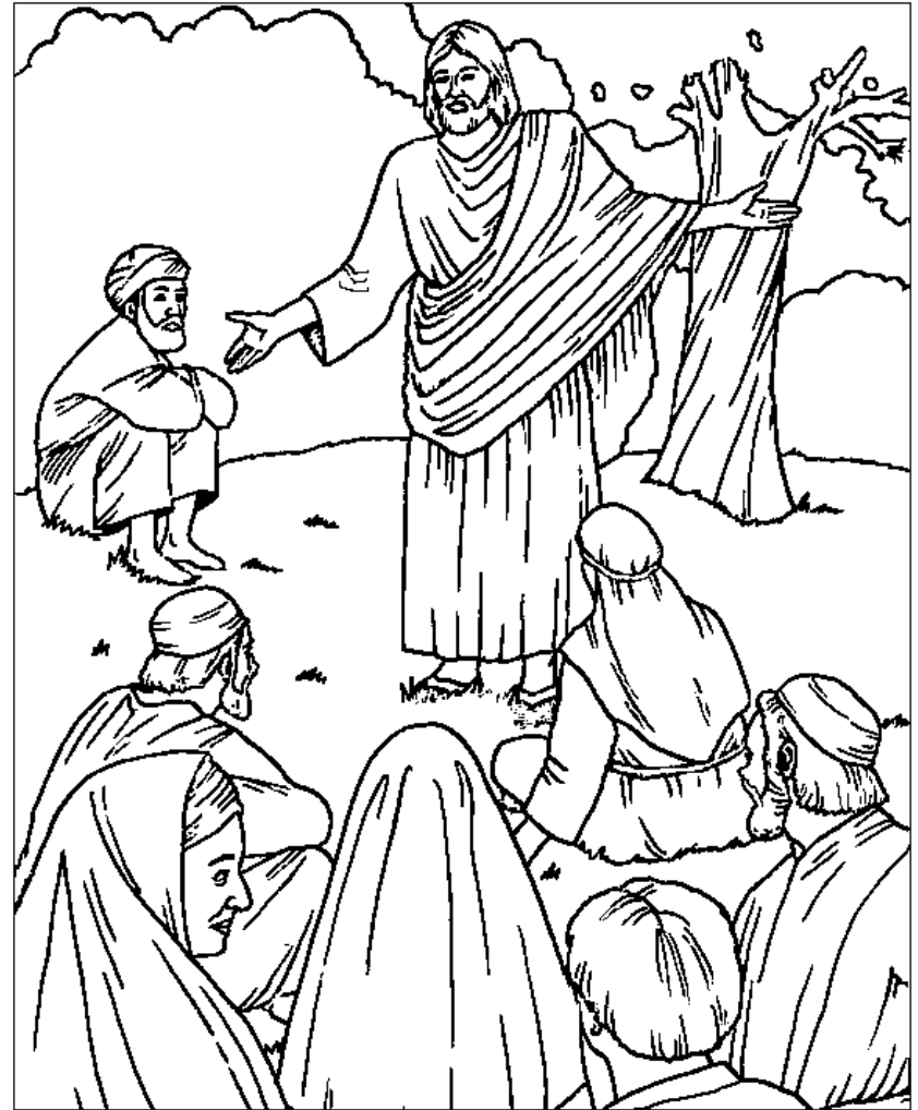
The Sermon on the Mount Matthew 5:1-12

From BibleStoryCard Learning System(tm) Coloring Book © 1996 Wesleyan Publishing House. Used by permission. Additional BibleStoryCard resources are available by calling 1-800-493-7539 or visiting online http://www.wesleyan.org/941/biblestorycards