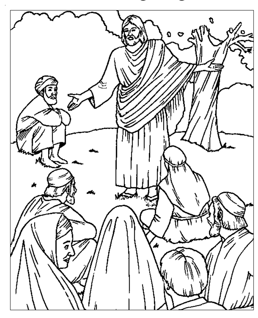
The Sermon on the Mount Matthew 5:1-12

From BibleStoryCard Learning System(tm) Coloring Book © 1996 Wesleyan Publishing House. Used by permission. Additional BibleStoryCard resources are available by calling 1-800-493-7539 or visiting online http://www.wesleyan.org/941/biblestorycards