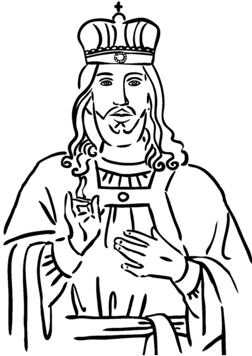
Christ the King John 18:33-37