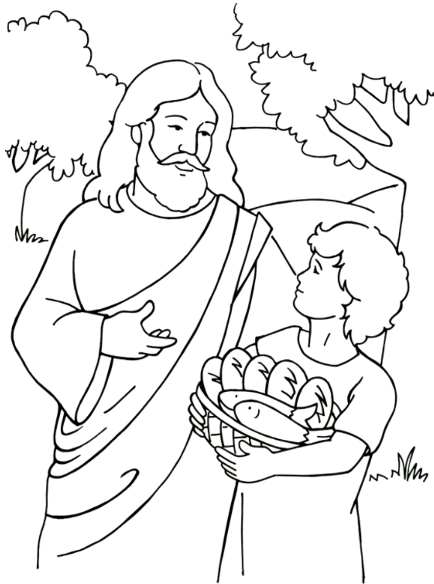
Jesus Feeds the 5000