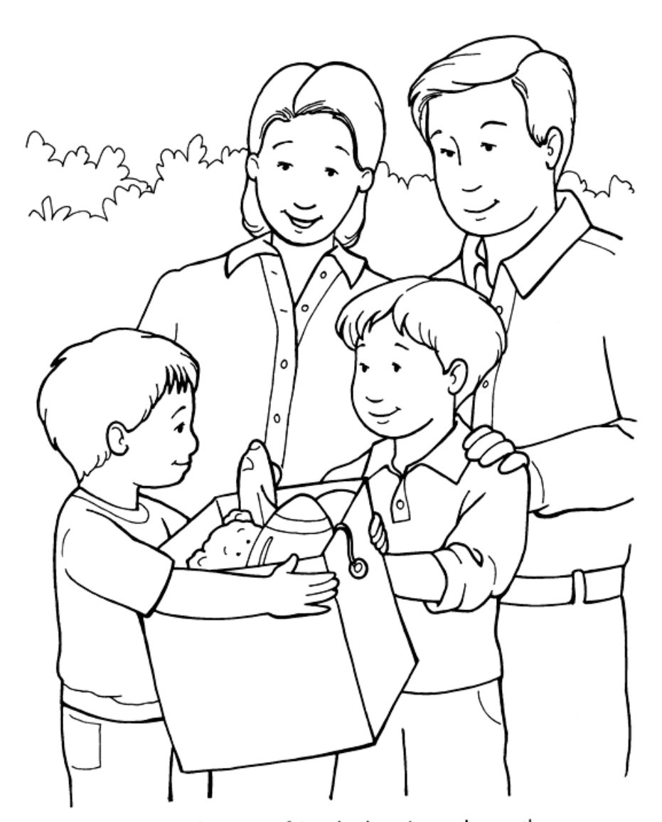
I can show my friends that Jesus loves them.

From Thru-the-Bible Coloring Pages for Ages 4-8. © 1986,1988 Standard Publishing. Used by permission. Reproducible Coloring Books may be purchased from Standard Publishing, www.standardpub.com, 1-800-543-1301.