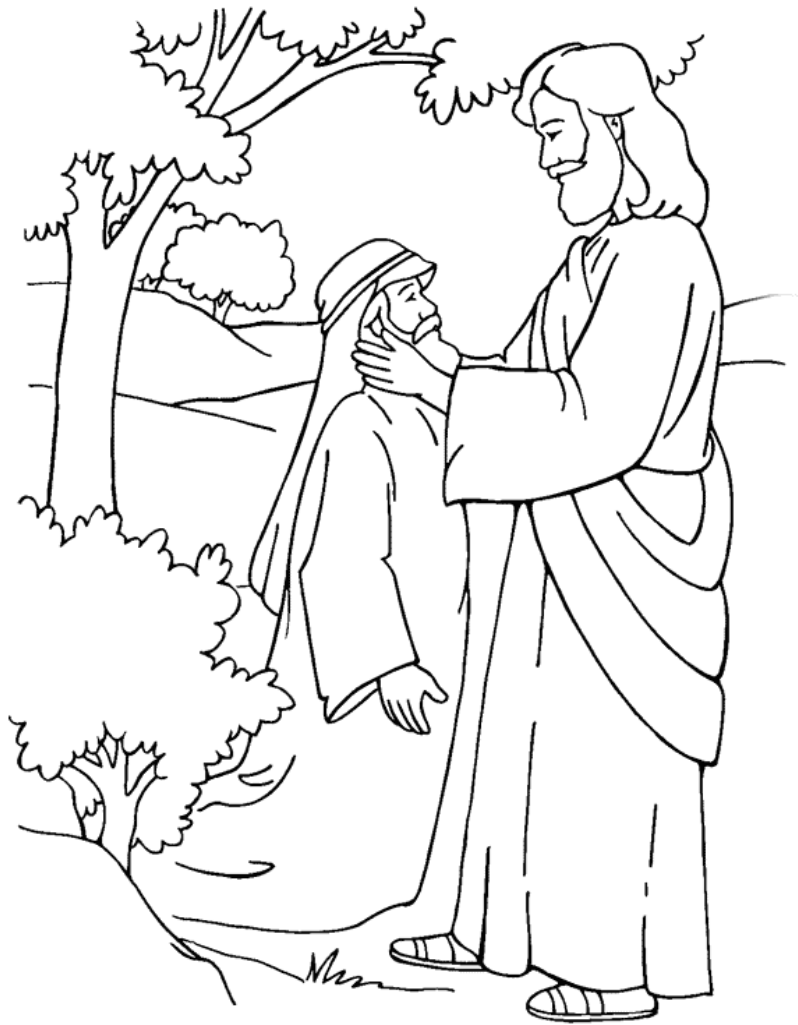
Jesus Heals a Deaf Man Mark 7:31-37

From Thru-the-Bible Coloring Pages © Standard Publishing. Used by permission. Reproducible Coloring Books may be purchased from Standard Publishing, www.standardpub.com , 1-800-323-5473.