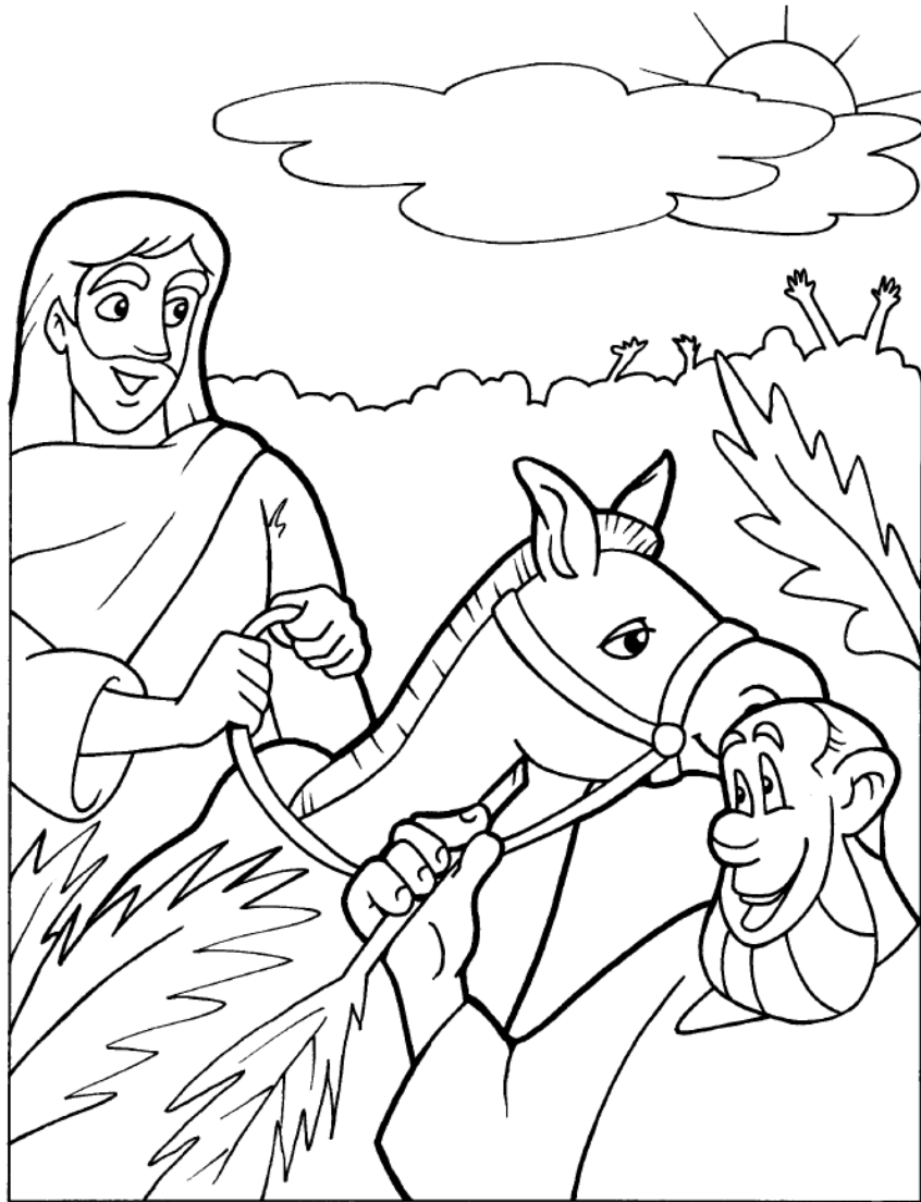
The Triumphal Entry

Can you help Jesus find the way through the streets of Jerusalem to the temple?