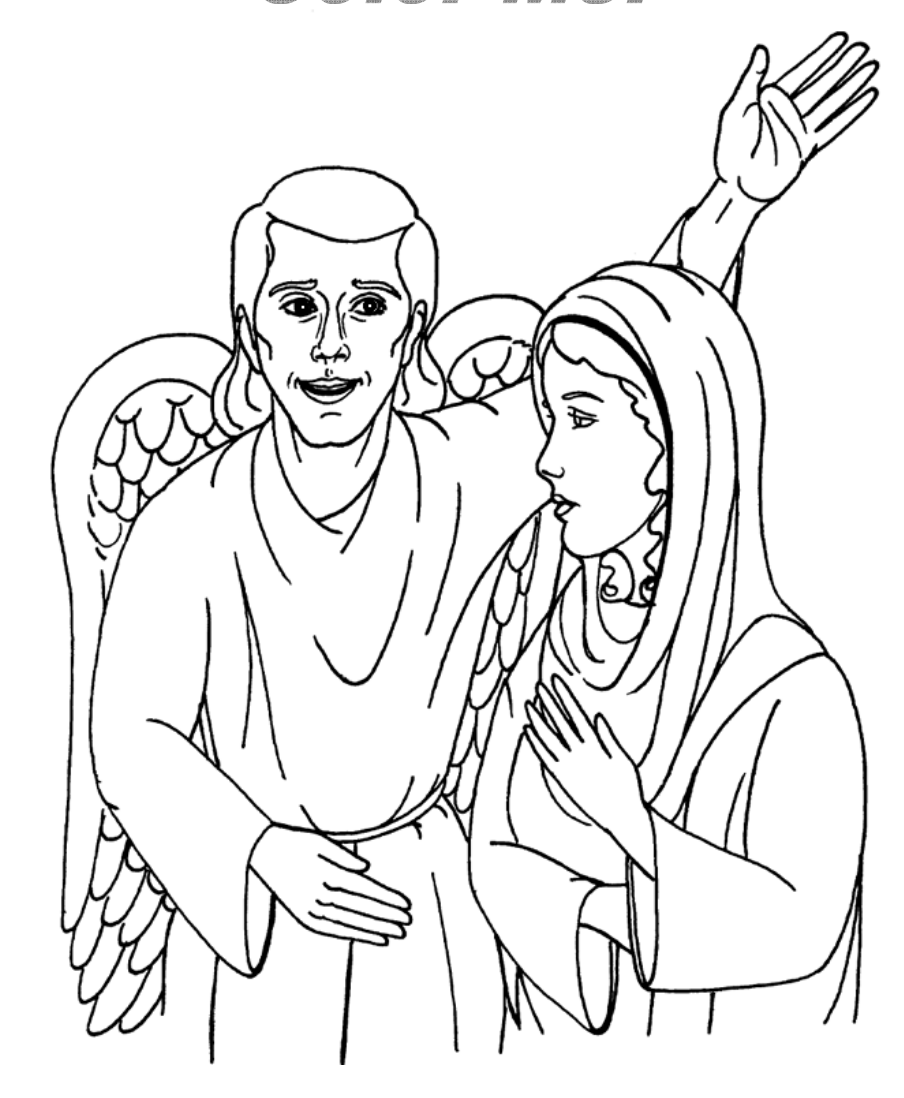
The Angel Gabriel Appears to Mary Luke 1:26-38

Copyright © CalvaryCurriculum.com Used by Permission