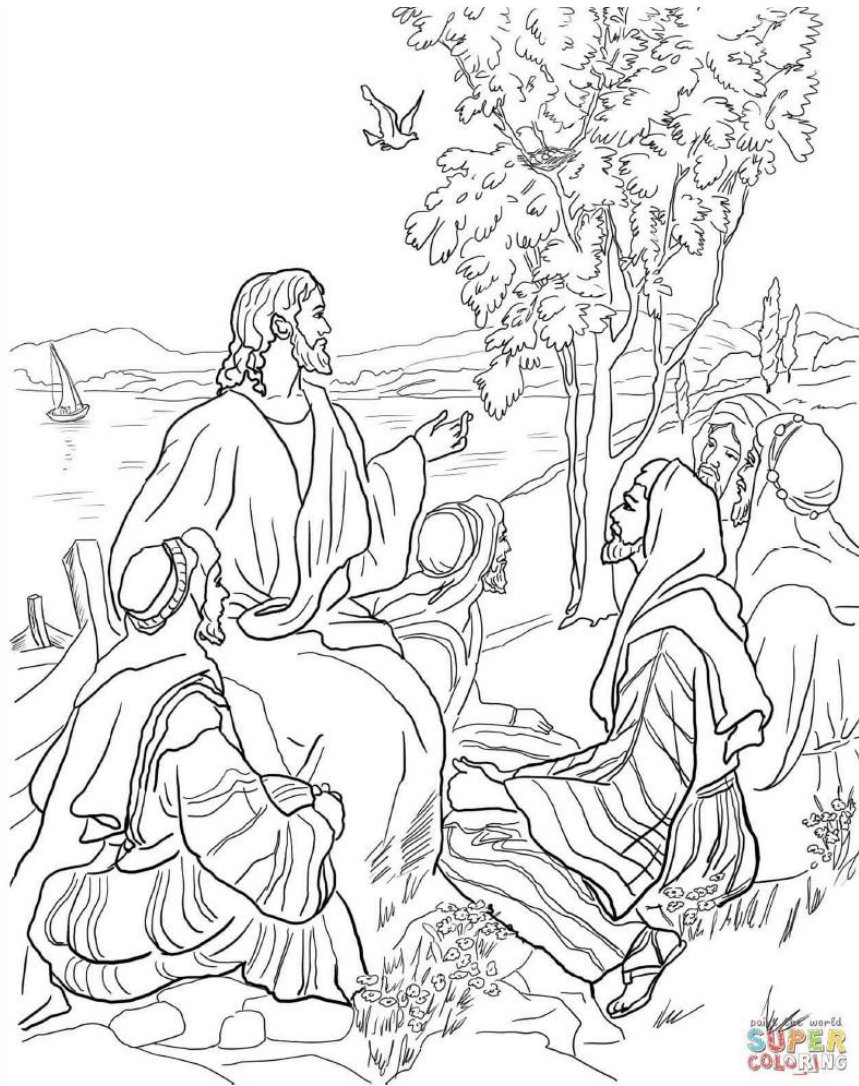
The Parable of the Mustard Seed and the Yeast Matthew 13:31-33

Each number represents a letter of the alphabet. Substitute the correct letter for the numbers to reveal the coded words.