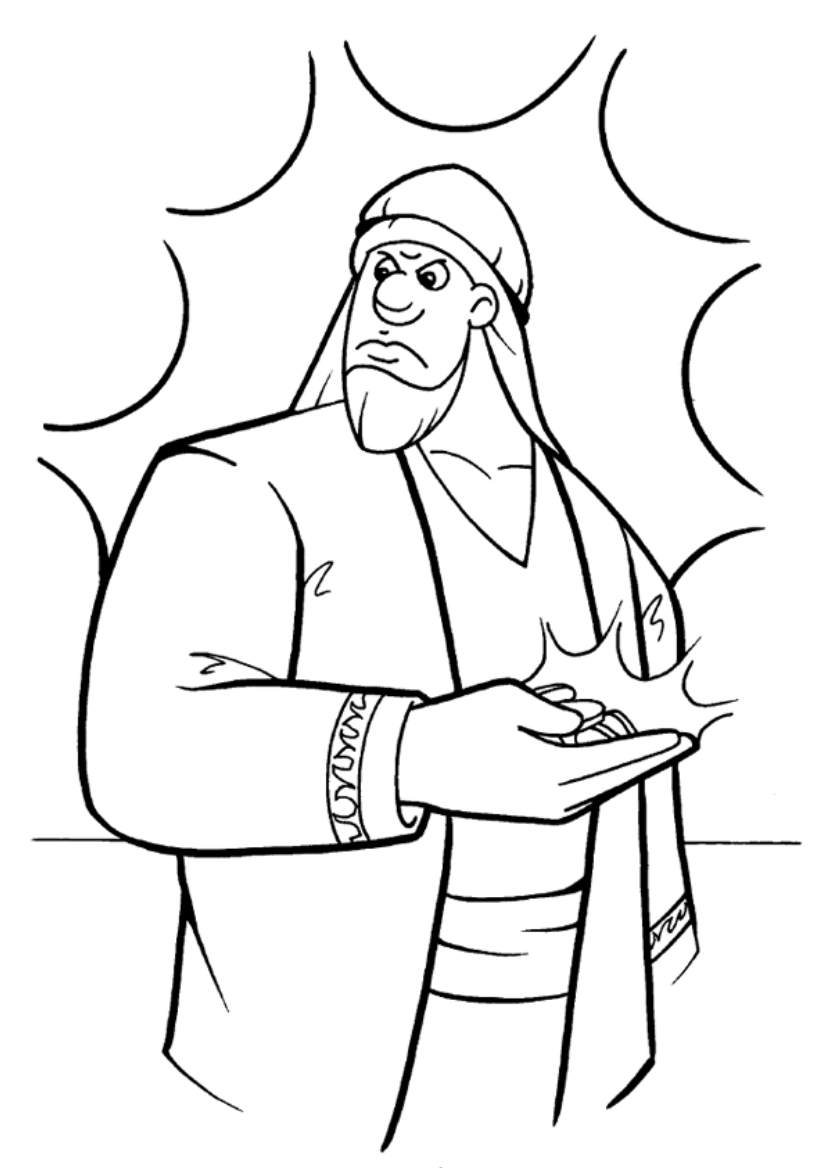
The Parable of the Talents Matthew 25:14-30

Copyright © CalvaryCurriculm.com Used by Permission