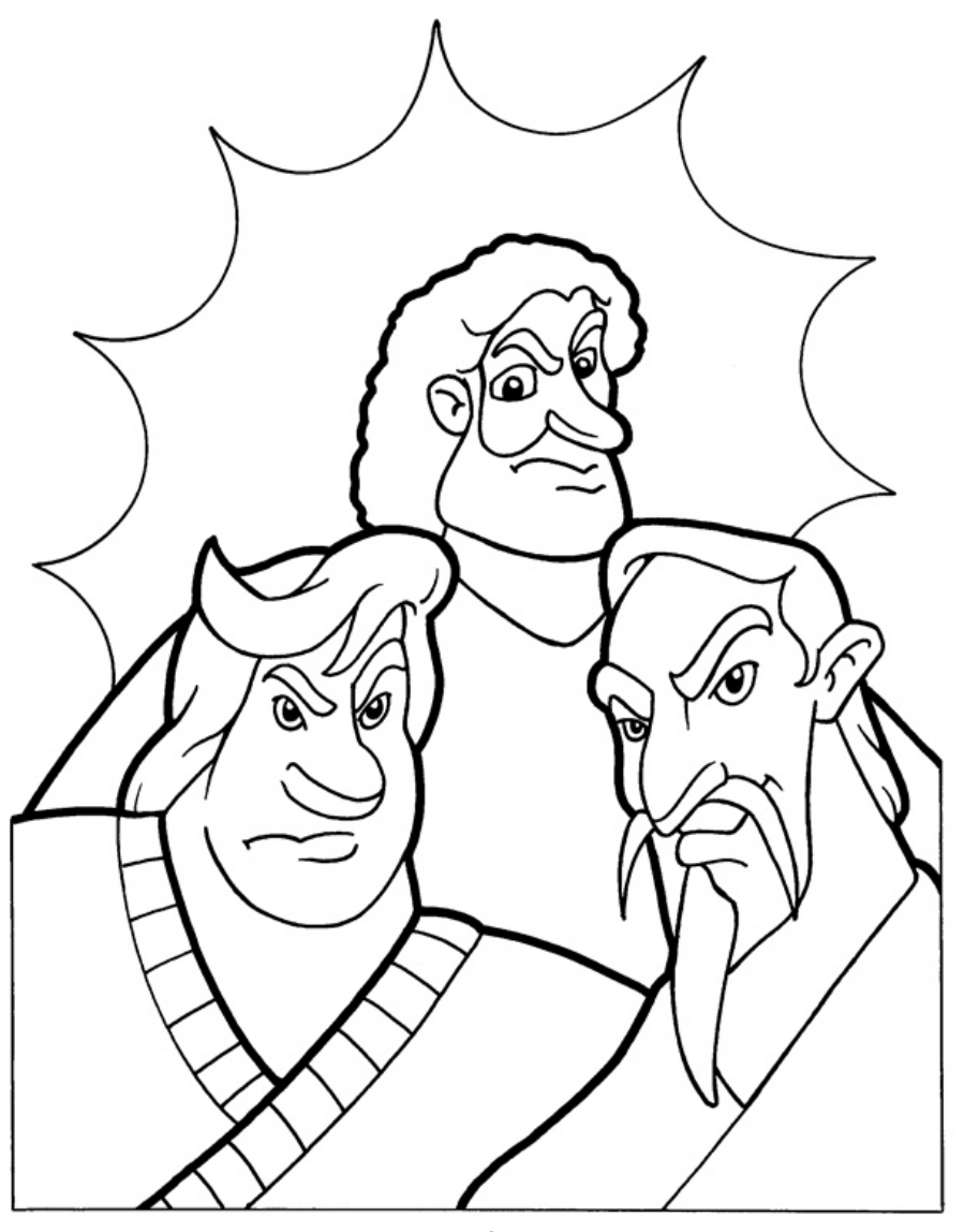
The Parable of the Tenants Matthew 21:33-46

Copyright © CalvaryCurriculum.com Used by Permission