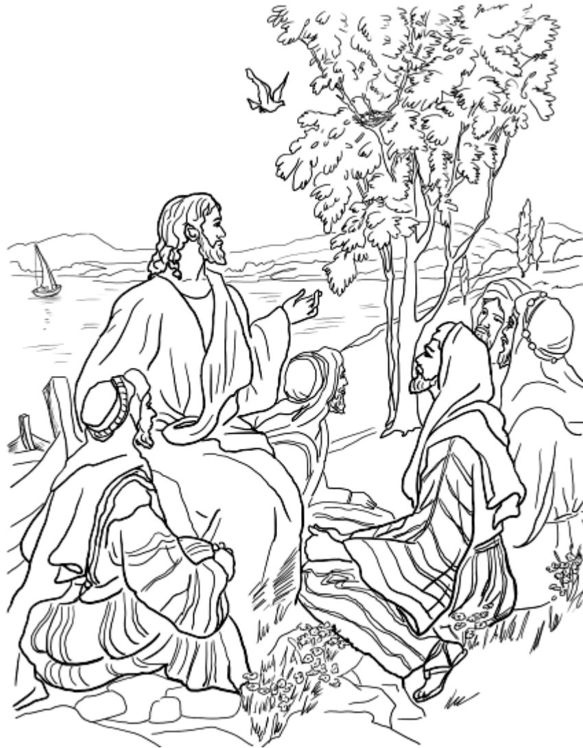
The Parable of the Mustard Seed Mark 4:30-34

A word has been removed from each sentence and listed below the sentences. Use the listed words to fill the blanks.