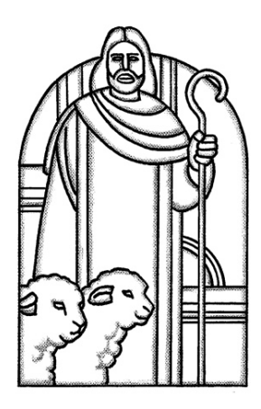
Copyright © Sermons4Kids, Inc. May be reproduced for Ministry Use