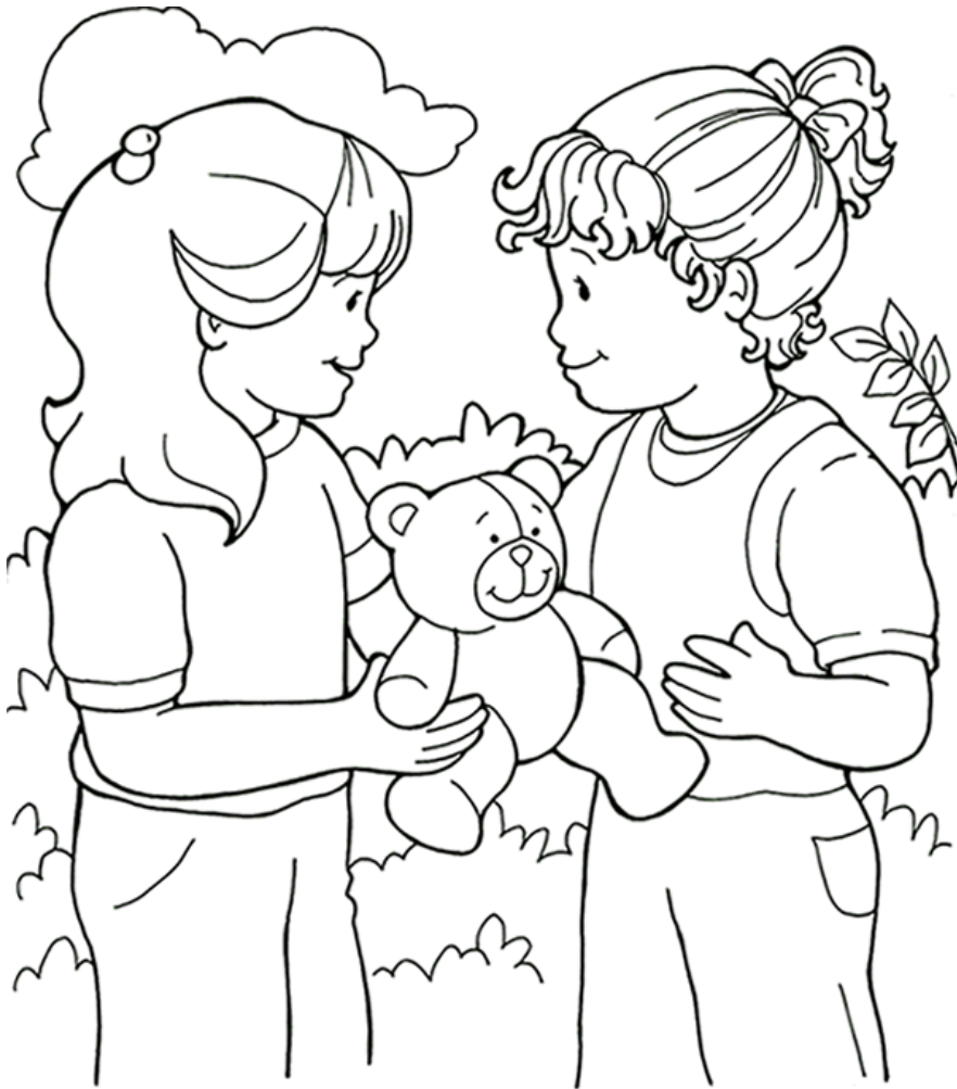
I can follow Jesus by sharing.

Each number represents a letter of the alphabet. Substitute the correct letter for the numbers to reveal the coded words.