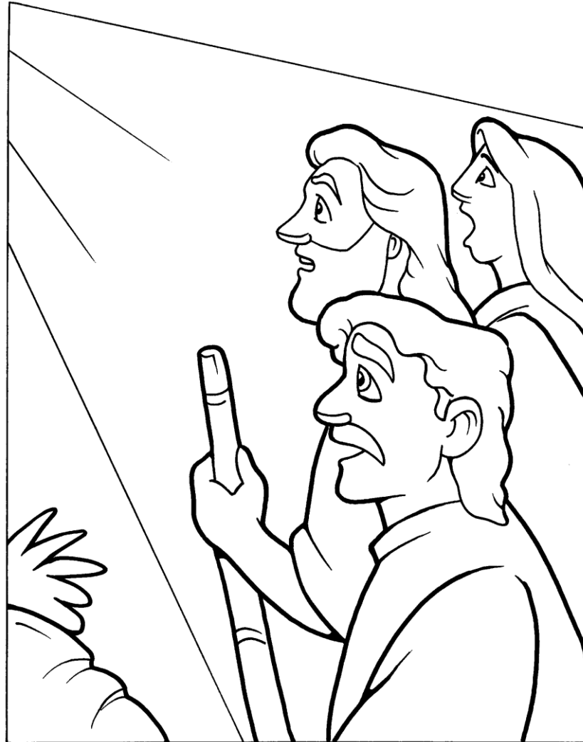
The Transfiguration Mark 9:2-9