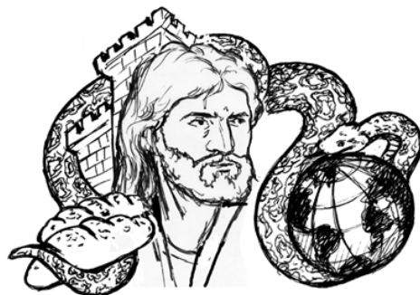
The Temptation of Jesus