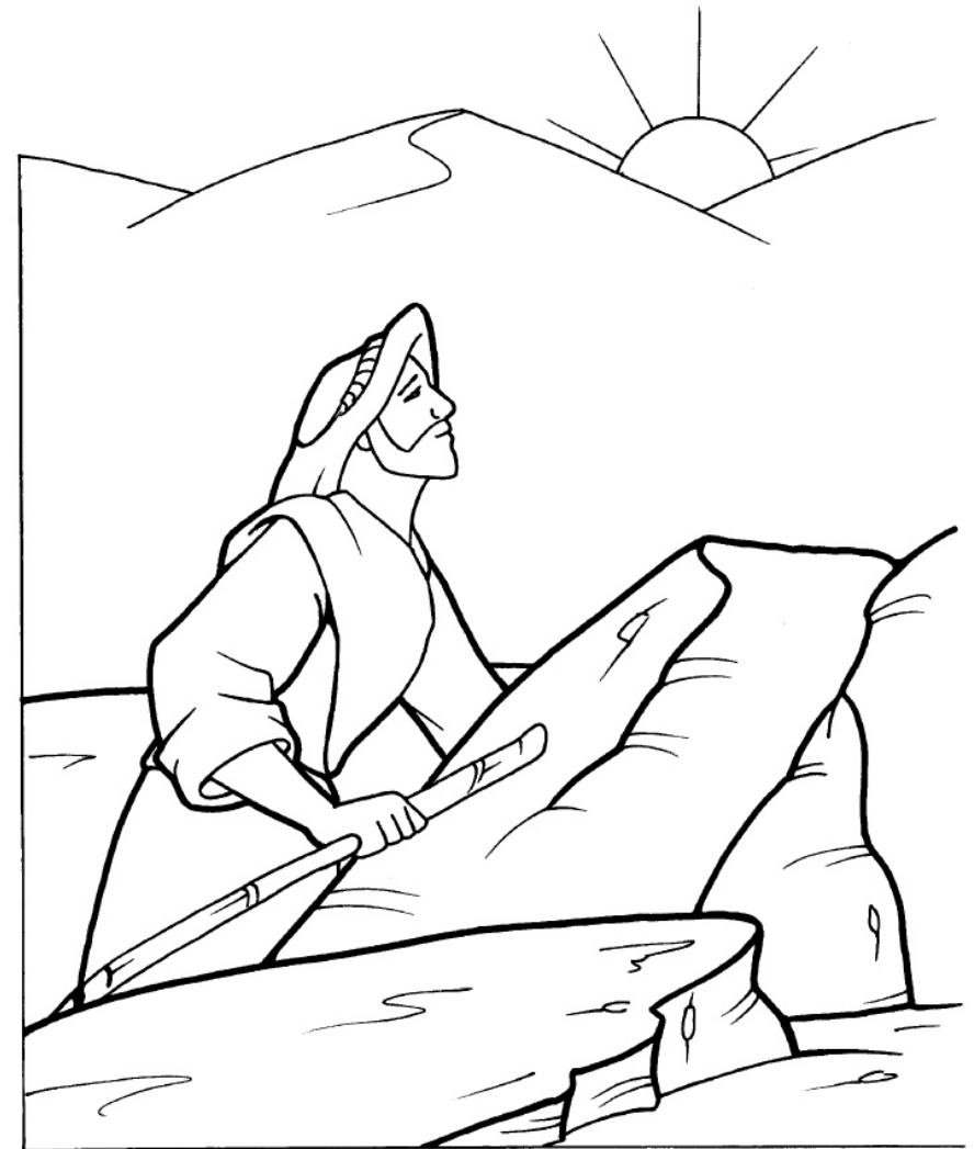
The Temptation of Jesus

Then Jesus was led by the Spirit into the desert to be tempted by the devil. Matthew 4:1 (NIV)