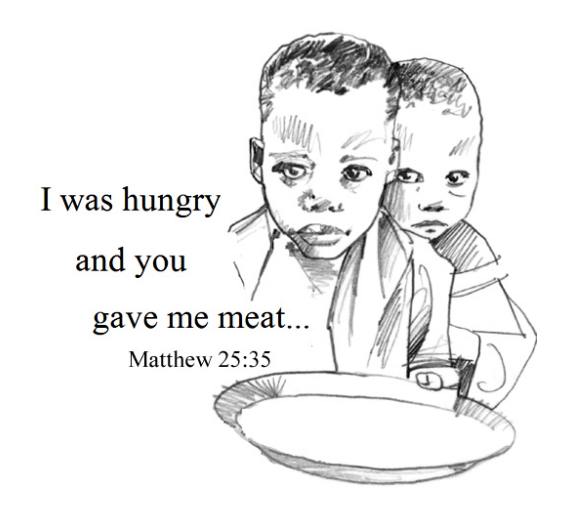
Copyright © Sermons4Kids, Inc. May be reproduced for Ministry Use