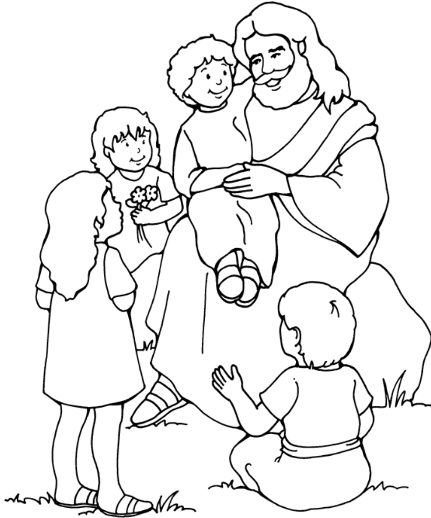
Jesus and the Children

From Thru-the-Bible Coloring Pages © 1986,1988 Standard Publishing. Used by permission. Reproducible Coloring Books may be purchased From Standard Publishing, www.standardpub.com, 1-800-323-5473.