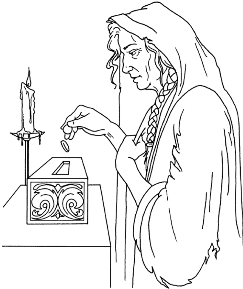
The Widow's Mite

Each number represents a letter of the alphabet. Substitute the correct letter for the numbers to reveal the coded words.