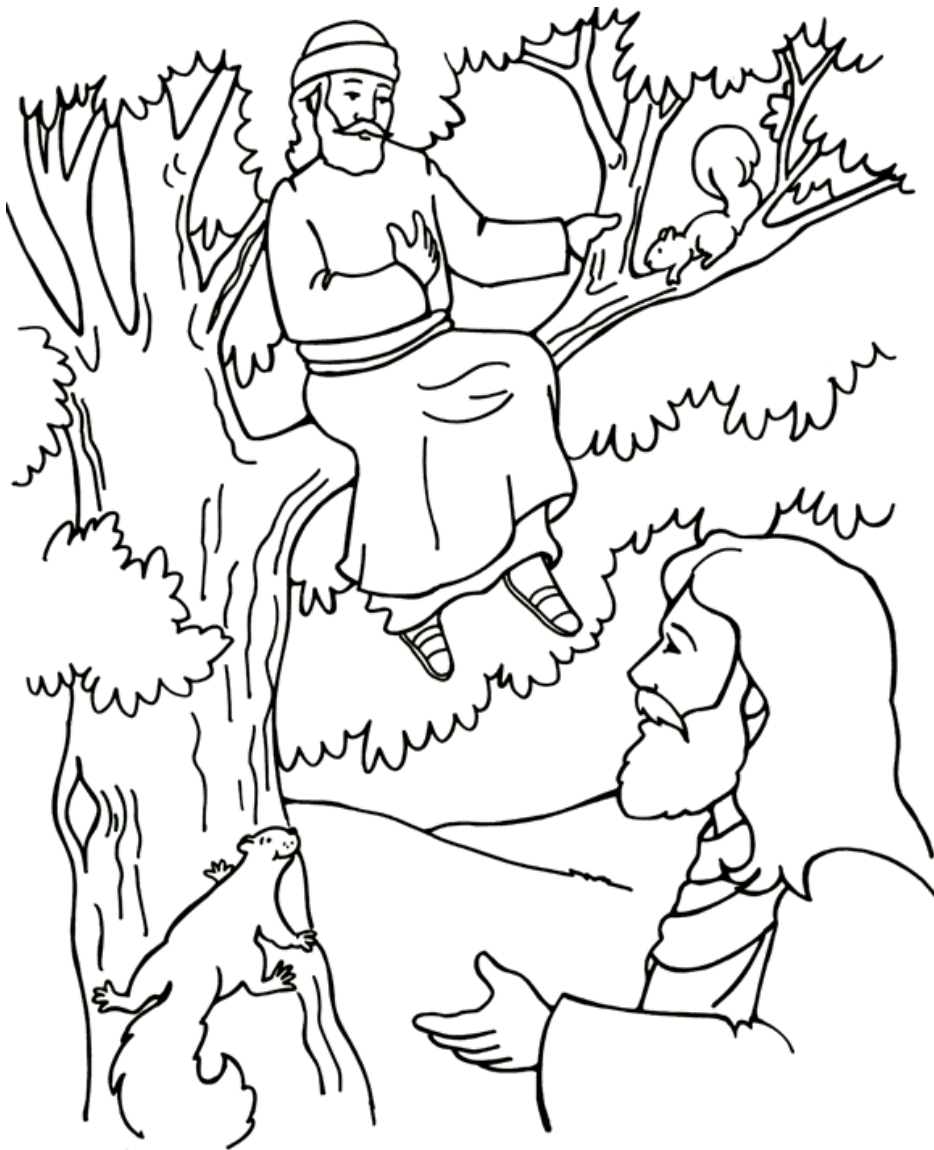
Jesus and Zacchaeus Luke 19

From Thru-the-Bible Coloring Pages for Ages 4-8. © Standard Publishing. Used by permission. Reproducible Coloring Books may be purchased from Standard Publishing, www.standardpub.com , 1-800-543-1301. Used by permission