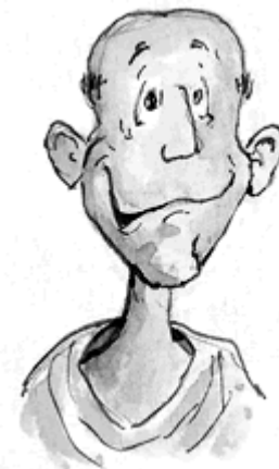
Zacchaeus © Henry Martin

From Thru-the-Bible Coloring Pages for Ages 4-8. © Standard Publishing. Used by permission. Reproducible Coloring Books may be purchased from Standard Publishing, www.standardpub.com , 1-800-543-1301. Used by permission